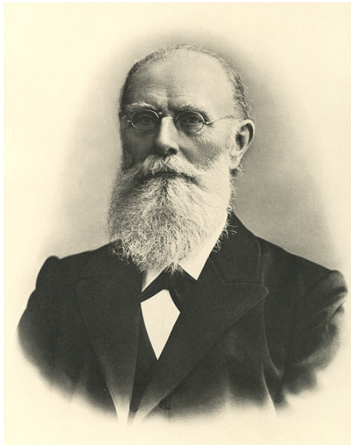
Franz Wüllner: It's like you asked Chat GPT to create a German composer from the Nineteenth Century.

“Schlafe, mein Herzchen, schlafe“ ( sleep my darling, sleep ).